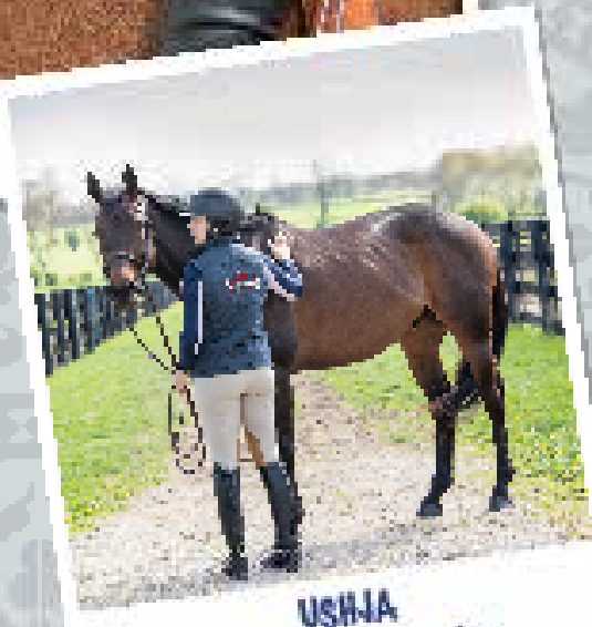
USHJA Outreach Champion