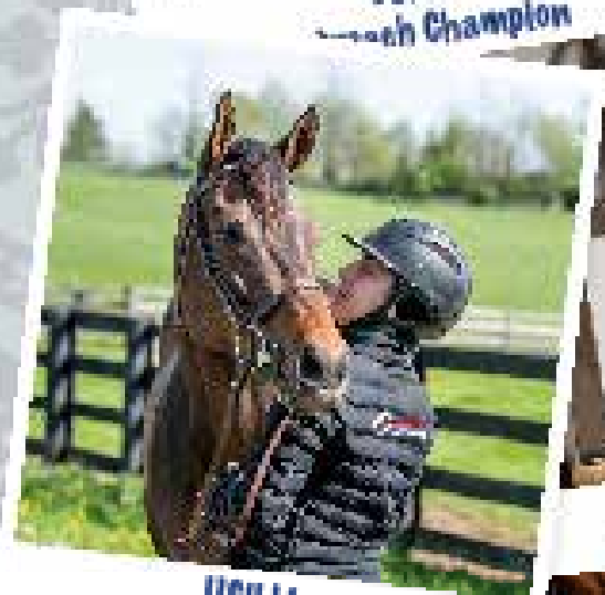
USHJA Outreach Champion