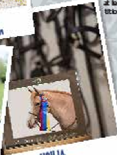
USHJA Outreach Champion